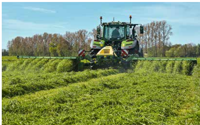
△ The conditioned material looks very different from that cut without conditioner. The conditioner crimps the crops significantly (right) which leads to faster wilting. The mower without conditioner leaves a mat of nearly untreated crop.