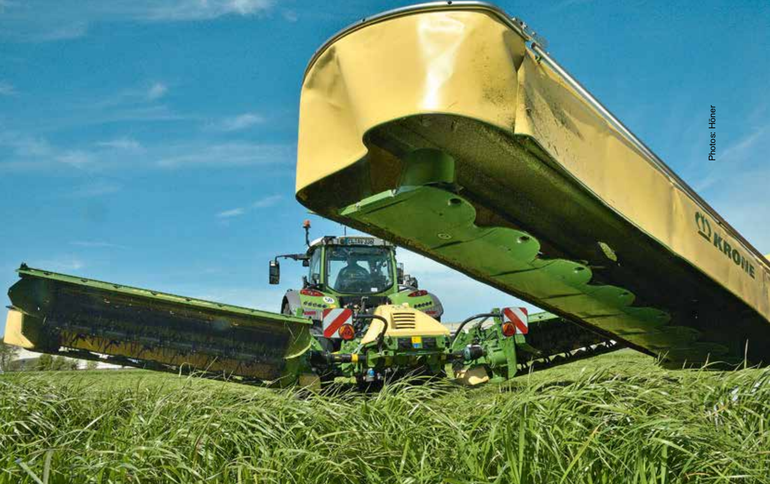
△ The mower combination without conditioner is much more lightweight at identical work widths and has a slimmer design.

The most striking difference between the two front mower models is their weight: the F320 without conditioner weighs nearly 800kg, the F320CV 1,280kg, i.e. nearly 500kg more.